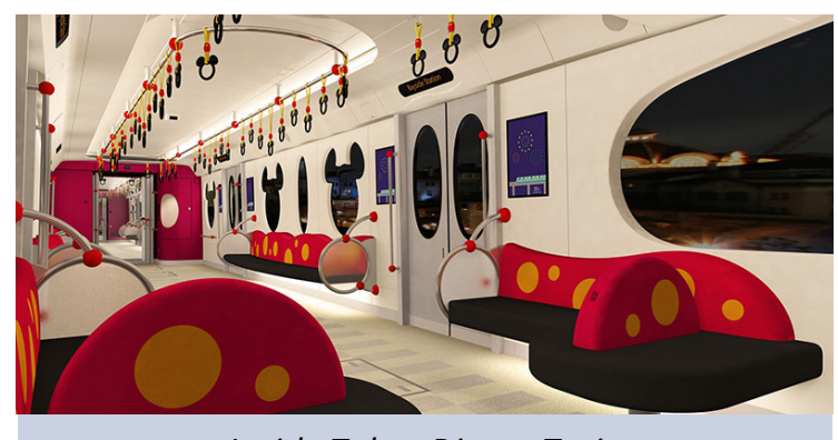
Inside Tokyo Disney Train