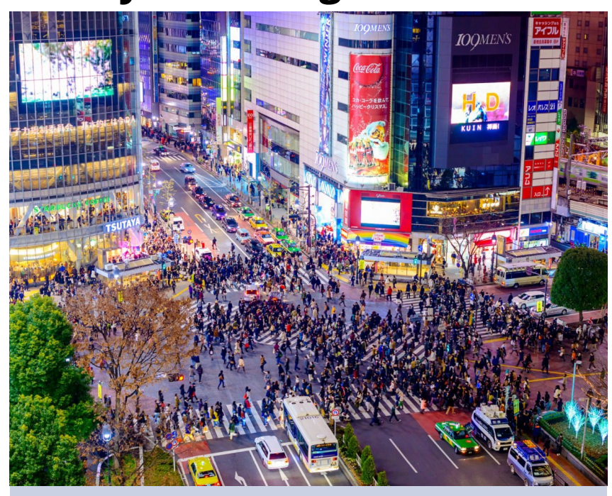
Shibuya Crossing Street ( Hachiko Statue In There )