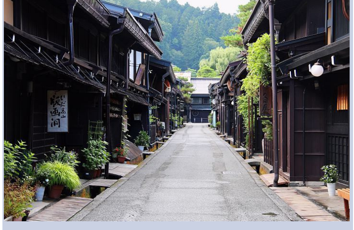
Takayama old Town

Rembarant Style Gotemba Style Komakado/ 3 Star Hotel Similar